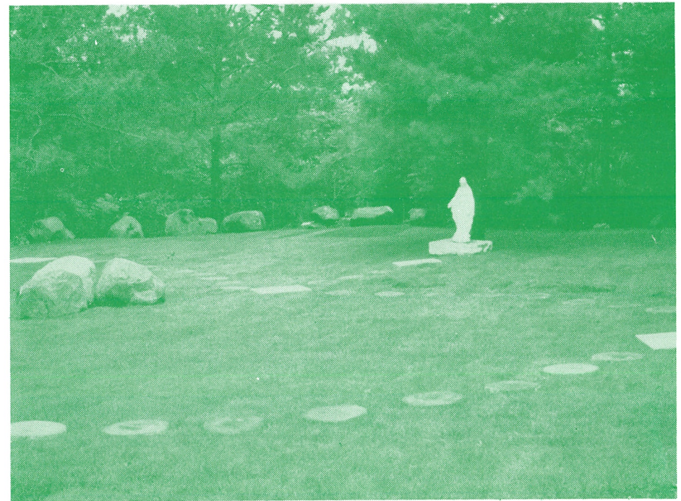
Ground Rosary, Indian Park