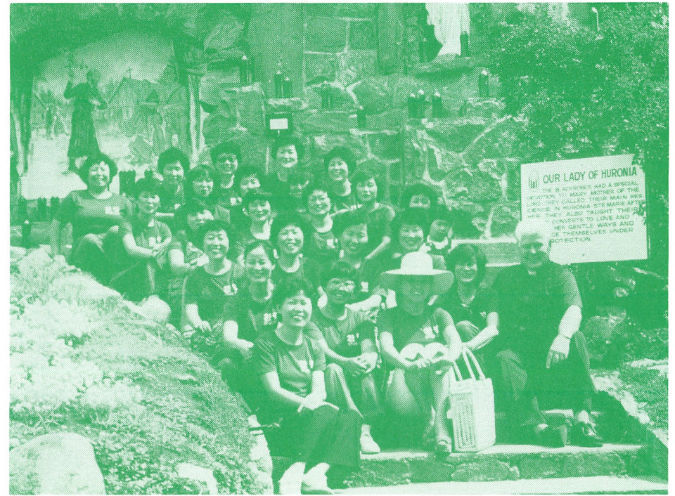
Pilgrimages, small, large — Korean students — Polish people