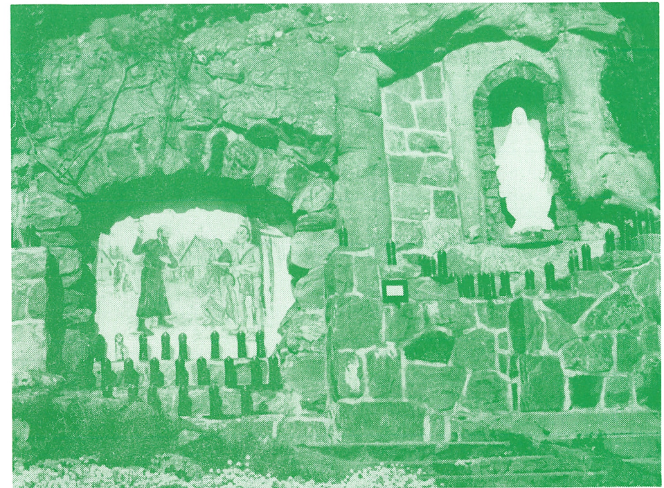
Our Lady of Huronia Shrine