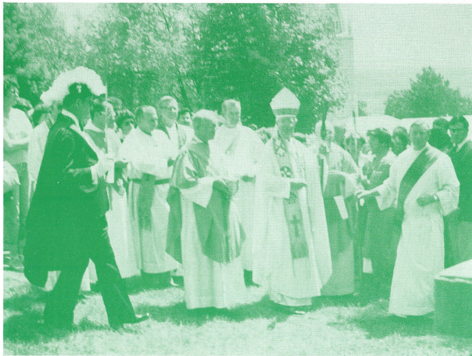
Indian Prayer Days