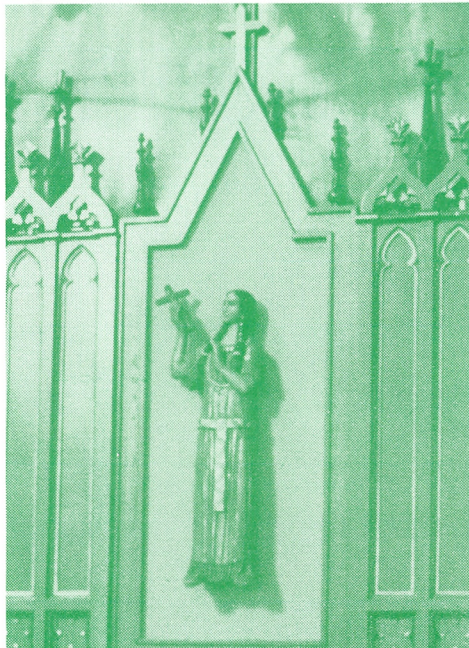
Blessed Kateri Tekakwitha