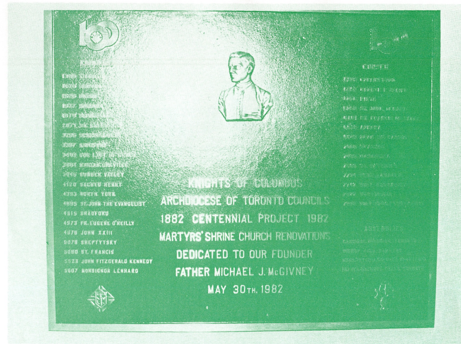
Knights of Columbus, Archdiocese of Toronto – Dedication – Pilgrimage